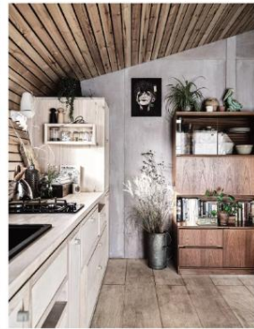
AHEAD OF THE CURVE Undulating hills and the natural curves of the local landscape are reflected in the atypically linear Paul and Rachael's cabin. Lateral wooden bookcase repeats angle for a reference to what lies back in time and place